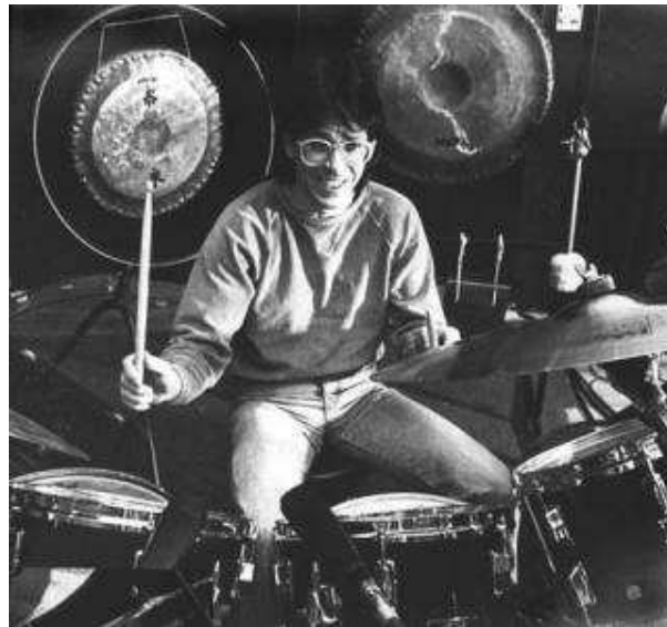
Jeff Porcaro TOTO