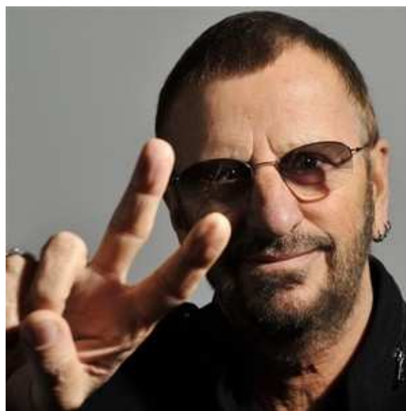
Ringo Starr The Beatles

"Lowdown," "Rosanna," "Georgy Porgy," "I Keep Forgettin".