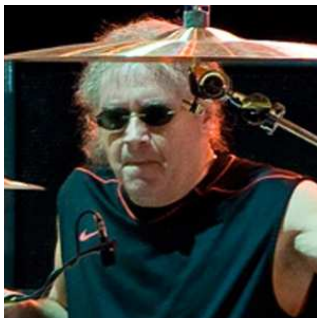
Ian Paice Deep Purple