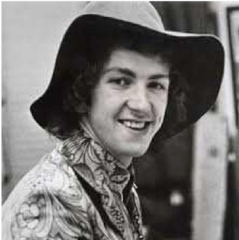
Mitch Mitchell- The Jimi Hendrix Experience

Standout Tracks- https://www.youtube.com/watch?v=5wCUIPNIQuA "19th Nervous Breakdown," "Paint it Black," "Gimme Shelter."